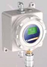
ICM K 2.0 AZ2

Hazardous environment permanently mounted in-line contamination monitor. High-risk and explosive environments.